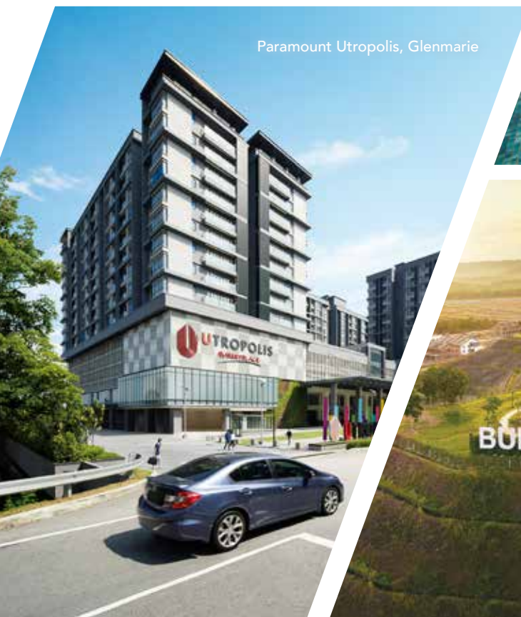
Paramount Utropolis, Glenmarie