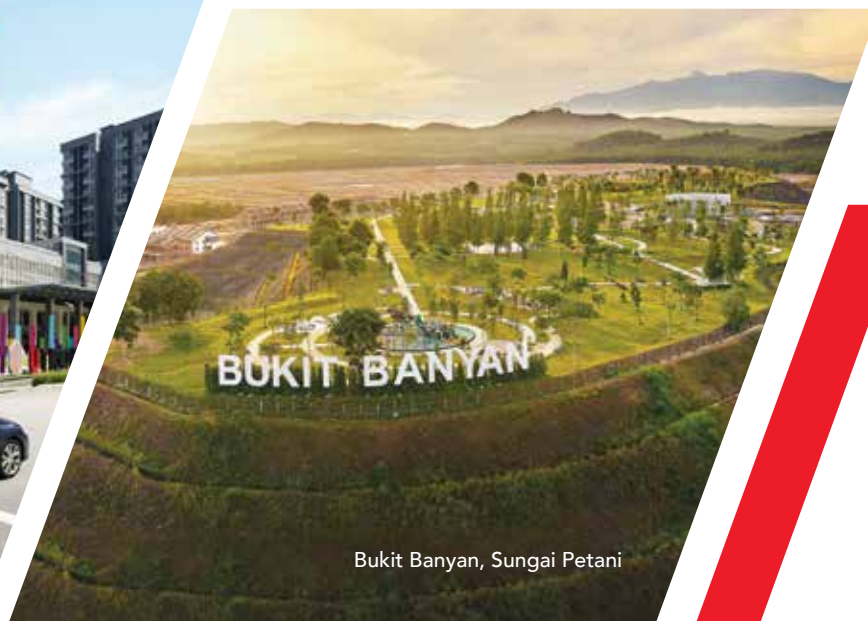
Bukit Banyan, Sungai Petani